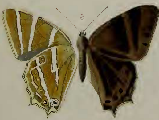
F. W. Poraxon Sc 1871.